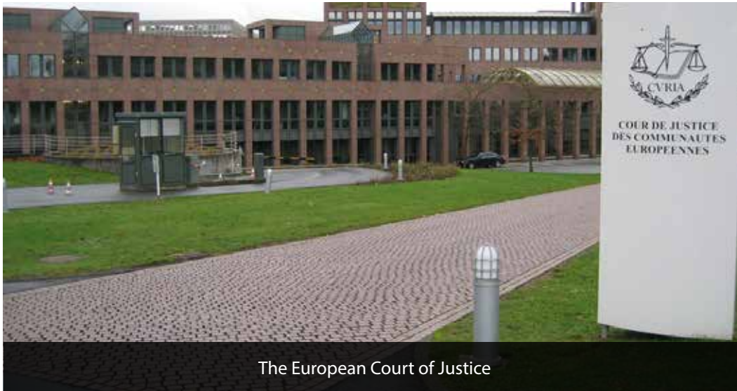
The European Court of Justice