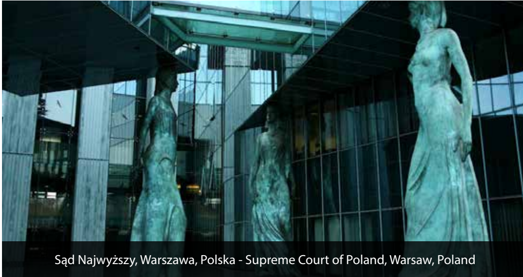
Sąd Najwyższy, Warszawa, Polska - Supreme Court of Poland, Warsaw, Poland

Changes to the Polish Criminal Procedure Code have far reaching consequences for experts