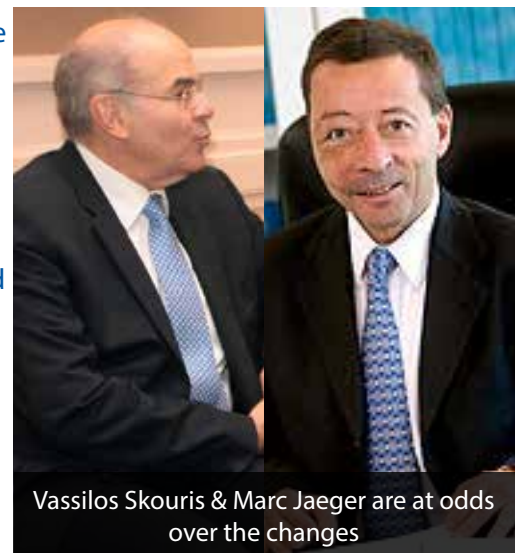
Vassilos Skouris & Marc Jaeger are at odds over the changes

The judges argued that the backlog was not as bad as it was made to appear and stated that there had only been a problem with a large backlog in 2010. However, since then improvements had been made and 80 percent of the backlog had been solved and the rest of the backlog is continuing to decrease. As can be evidenced by this recent meeting the debate continues to cause controversy.