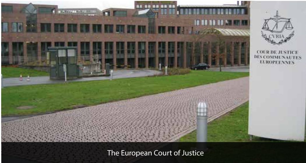
The European Court of Justice